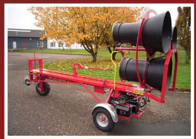
SELF-PROPELLED TREE BALER