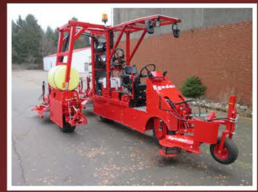
GANTRY TRACTOR MOW, SPRAY, BASAL PRUNE, AND MORE!