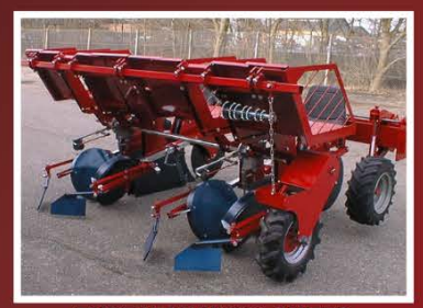
TYPE K TRANSPLANTER 1,2 & 3 ROW AVAILABLE! GPS CAPABLE!