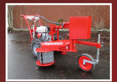
E9H TOOL CARRIER BASAL PRUNER 400-500 TREES/HOUR!