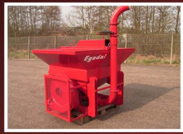
AIRFLOW FERTILIZER SPREADER 60 FT SPREADING WIDTH!