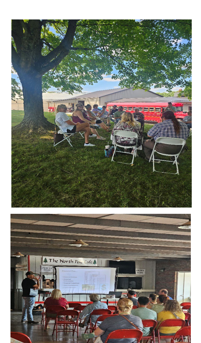
Thank you to our many vendors and sponsors: