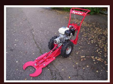
E9H W/ TREE CUTTER HARVEST UP TO 400 TREES/HOUR!