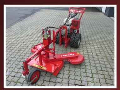
E9H W/ DUAL SWINGARM MOWER MORE ATTACHMENTS AVAILABLE!