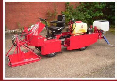
E4H TOOL CARRIER MOW, SPRAY, FERTILIZE & BASAL PRUNE ALL-IN-ONE!